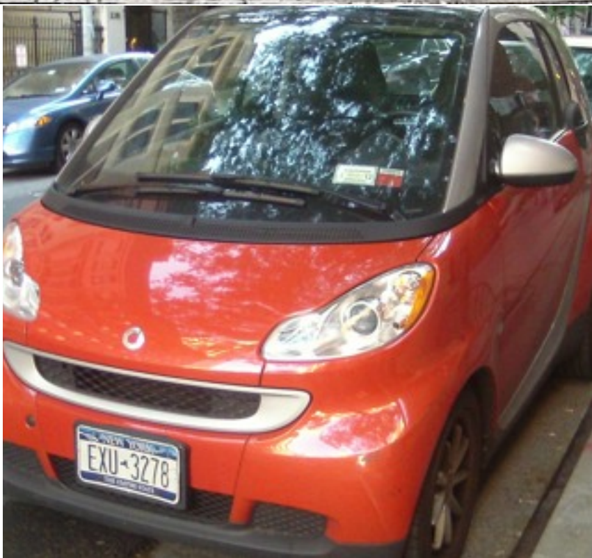
This is a picture of a car that is so small that it can only fit 1 or 2 people, just like a modern car.