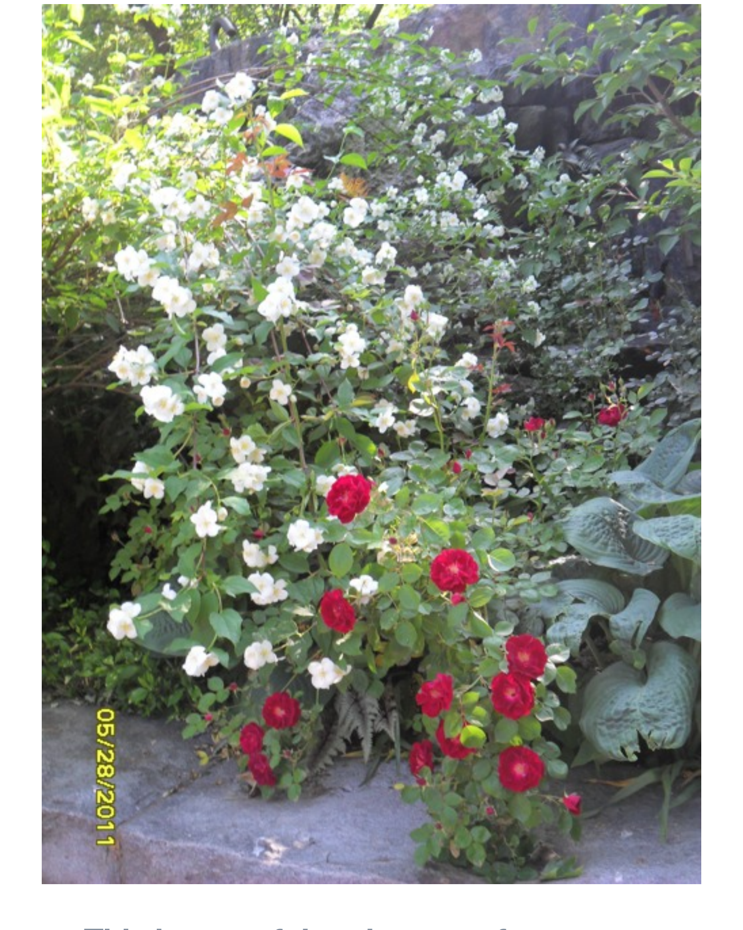
This is one of the pictures of roses that i took in Carl Schurz park.