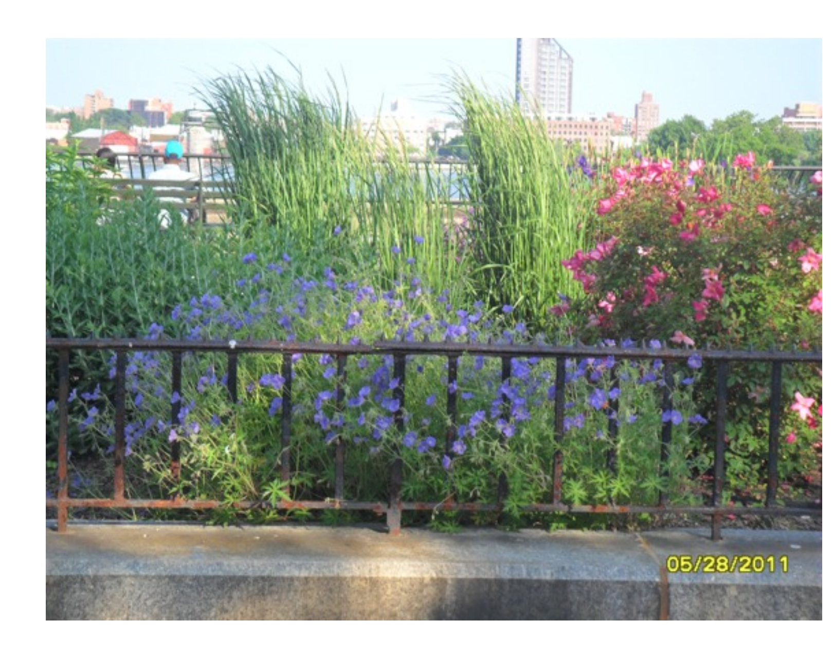
Carl Schurz's flowers