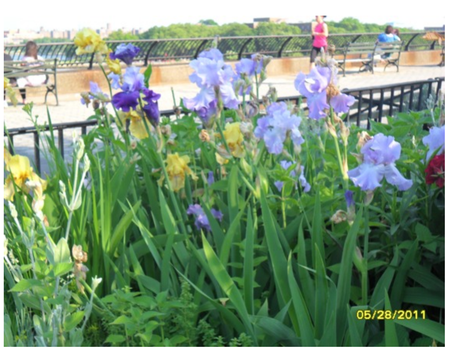
I took these blue and yellow flowers by the river in Carl Schurz park.