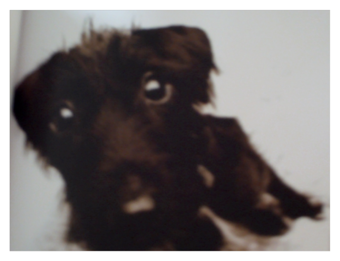
Dogs, you may think dogs can do nothing more than listen to commands.but dogs can do so much more than that.