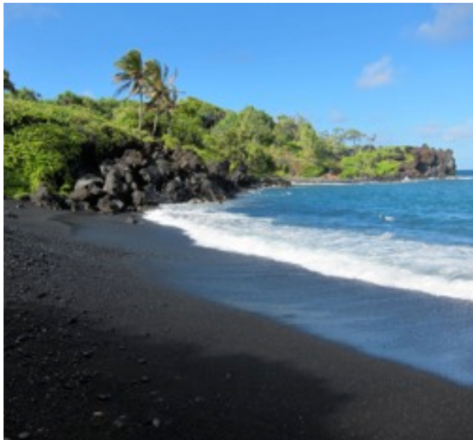
The black sand in this photo is not actually true sand it is volcanic rock. Sometimes there would be a lava arch there because the volcanic rock means that lava would normaly come in that direction and make a lava arch. (Top Photo)