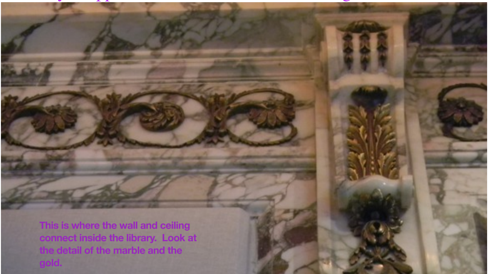
This is where the wall and ceiling connect inside the library. Look at the detail of the marble and the gold.

They thought that if New York was going to be one of the greatest cities in the world it needed a great library. They knew that it was important to have lots of books for learning and books just for enjoyment, but what was most important to them to have a beautiful building to keep them in. A beautiful building would bring people into the library to appreciate the books and the amazing architecture.