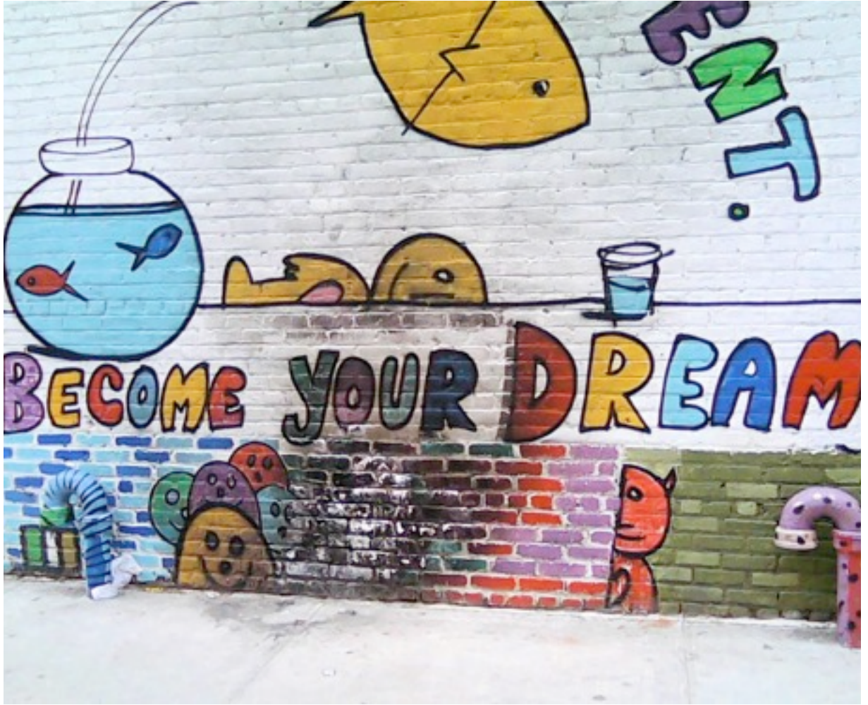
Seen on walls