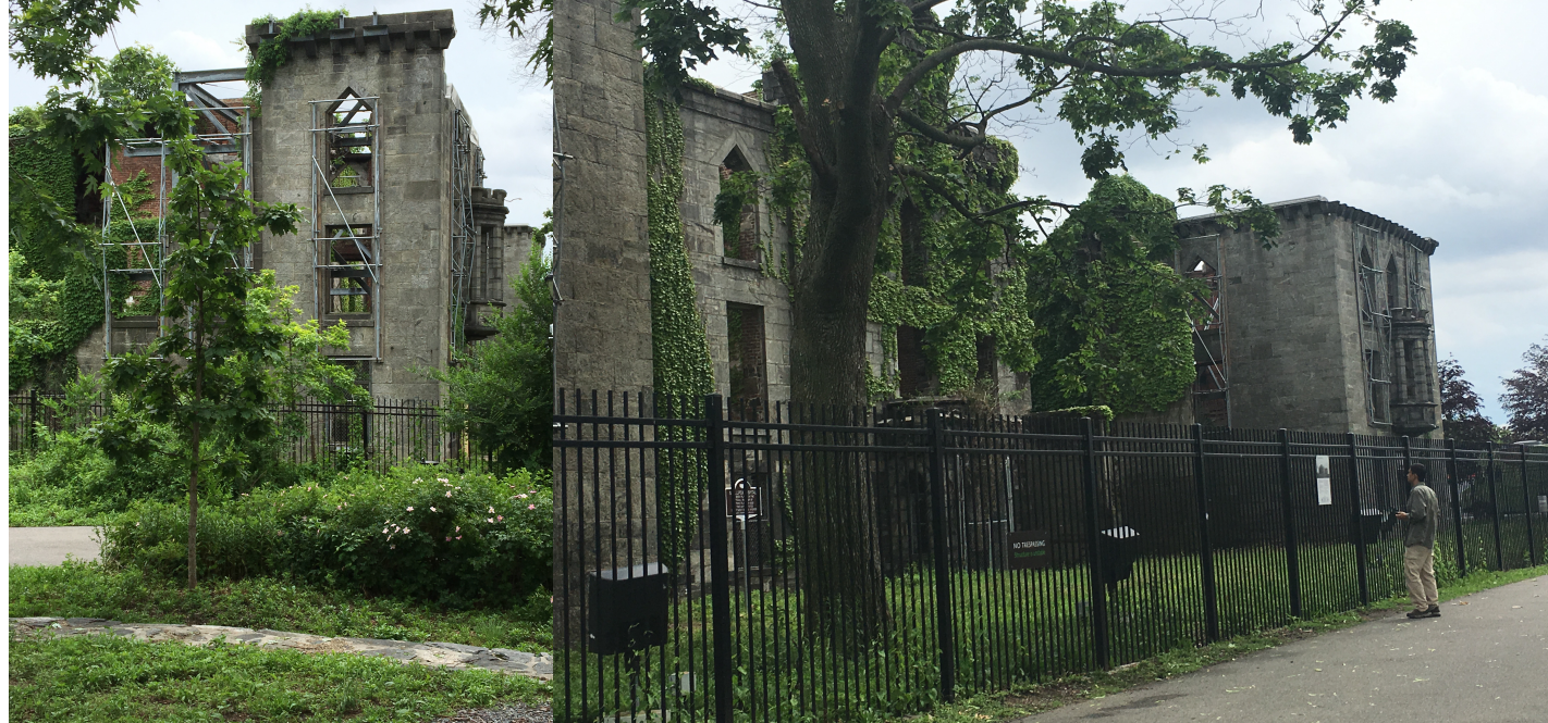
Small pox hospital