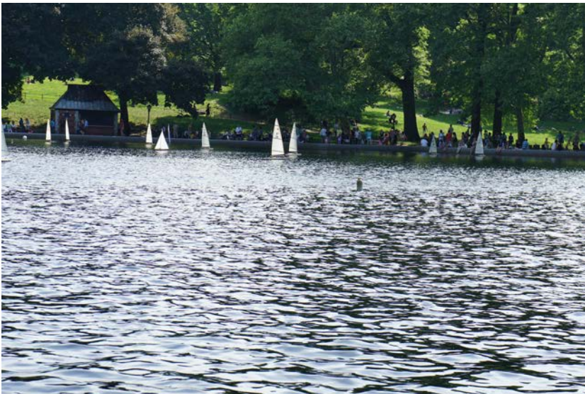
The top picture is showing a fountain at the entrance of Central Park, on the bottom is a pond for remote control boats and ducks for people to enjoy watching.