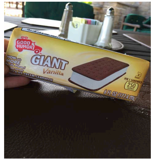
Ice Cream Sandwiches