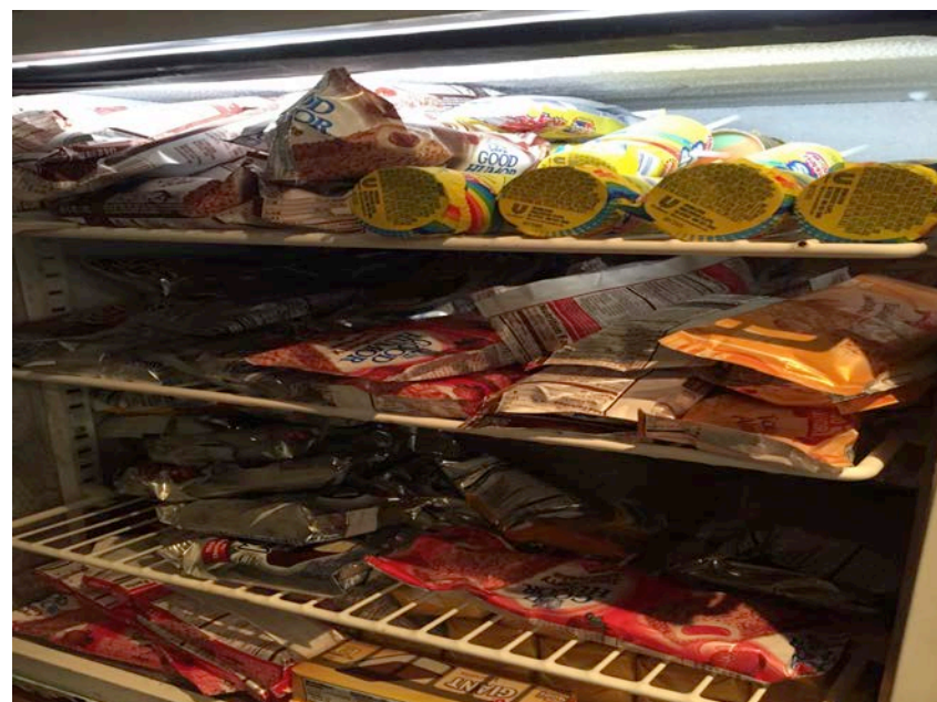
Popsicles and ice cream bars