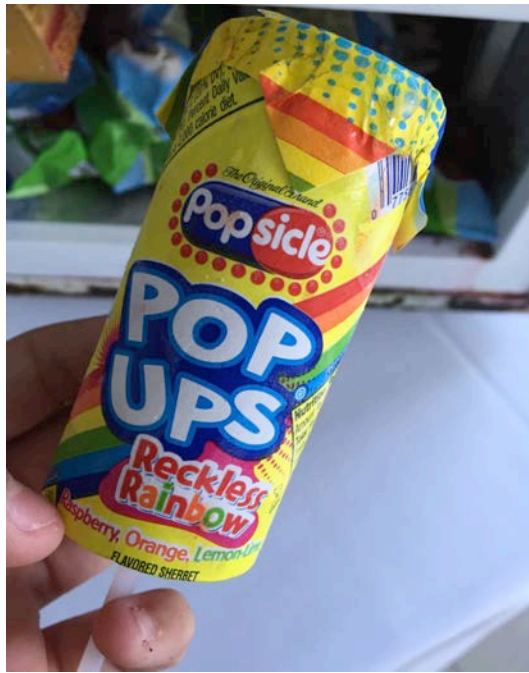
Pop Ups Popsicle