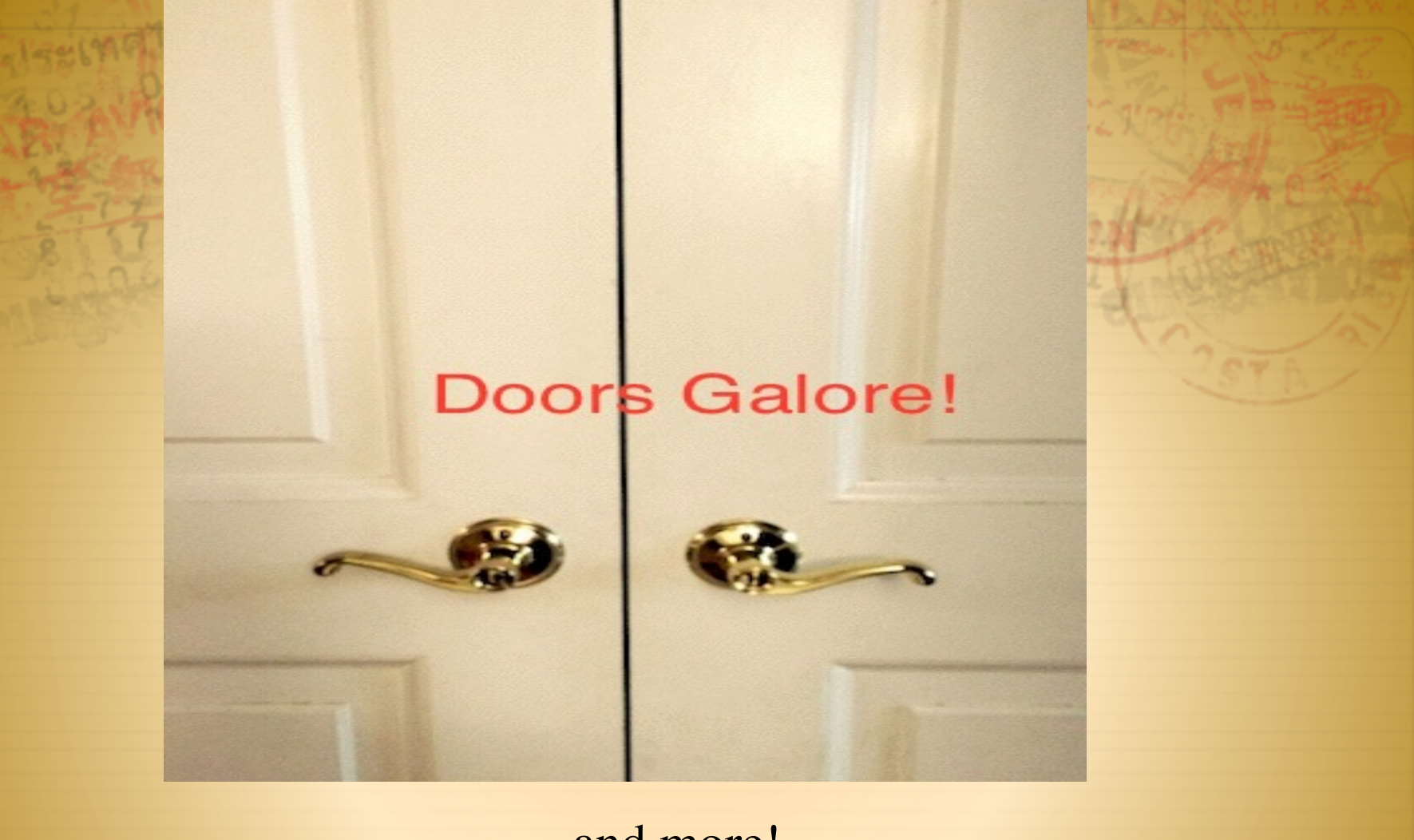
and more! By: Benjamin Gerchick