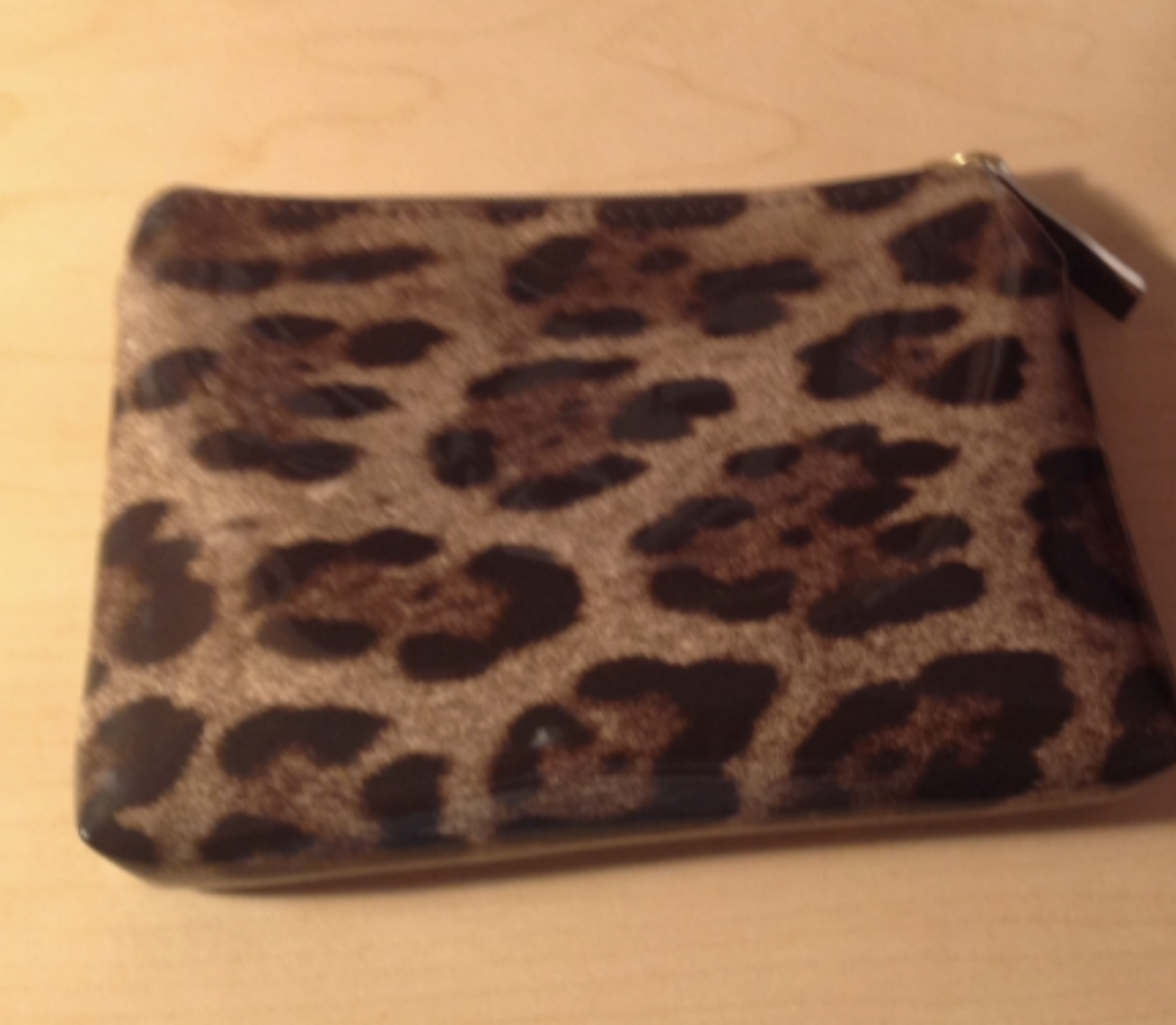
My mom's Make-up bag