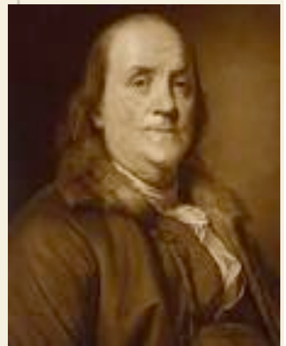
This is Ben Franklin.