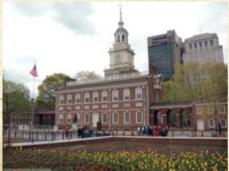
This is the Independence Hall.