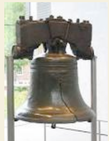
The Liberty Bell.