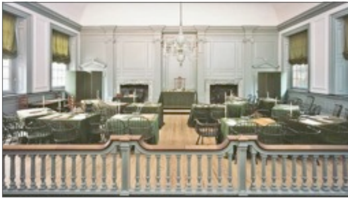
This is Independence Hall and William Penn