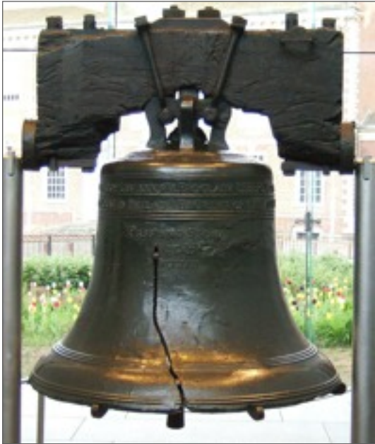
Benjamin Franklin and the Liberty Bell

Benjamin Franklin was born on January 6, 1706. He was the fifteenth child out of seventeen children in his family. His brother James was older than he was. His education at school only lasted for a short time: two years. After, he got a job as a candle maker. He did not have any fondness for this job. Candle making was a horrible job for Benjamin. After he told him he hated it, his father asked, "What job do you want then?" "I want to be a printer!" he replied enthusiastically. He got what he wanted. He became the apprentice of his brother, James Franklin, who was already a printer. He wasn't paid, but learned a trade. Eventually, he became a great printer. He made his own press, which made him a lot of money. He made his own newspaper, and a book called Poor Richard's Almanac , which had many sayings that he made such as, "a light purse, is a heavy curse." The paper used to make all this was made from recycled clothes. He went everywhere to get them. Soon enough, he was very successful. Eventually, he married a woman named Deborah. Ben Franklin helped out with a lot of things in this country. As he grew older, he made inventions such as the glass harmonica. Now, Ben Franklin's grave is next to his wife's and his daughter Sarah's grave.