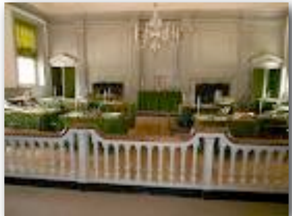
Inside Independence Hall