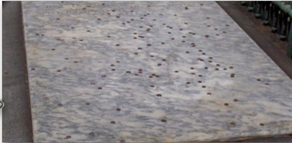
Benjamin Franklin's grave.