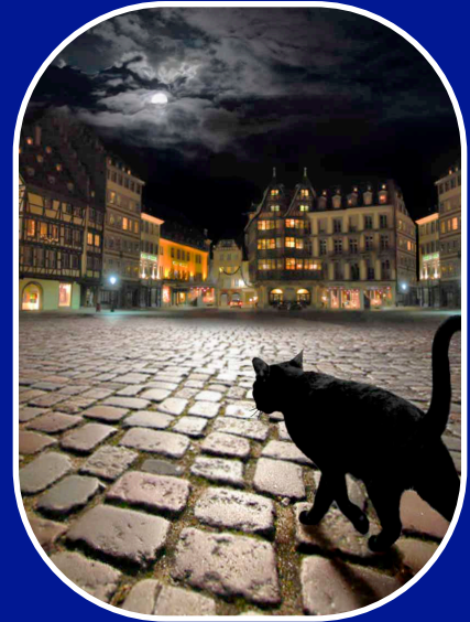
This is a picture of a stray cat in Strassbourg

I learned about stray cats during my research. However, the most important thing I learned is how to earn a cat 's trust. The lesson I learned was that when I see a stray cat I know it needs help to find its family.