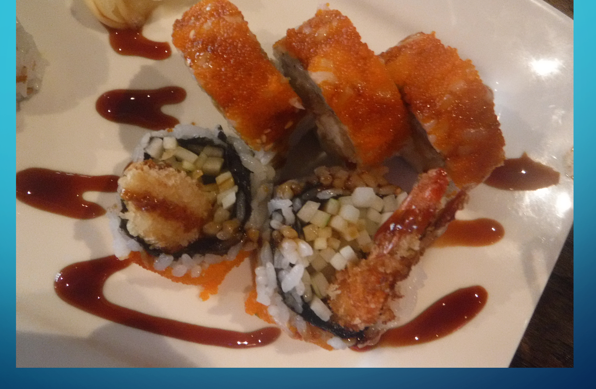
Artistically decorated with sauces and wrapped in rice...