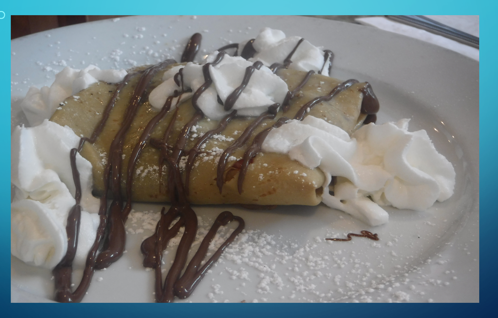
A folded thin pancake stuffed and decorated...