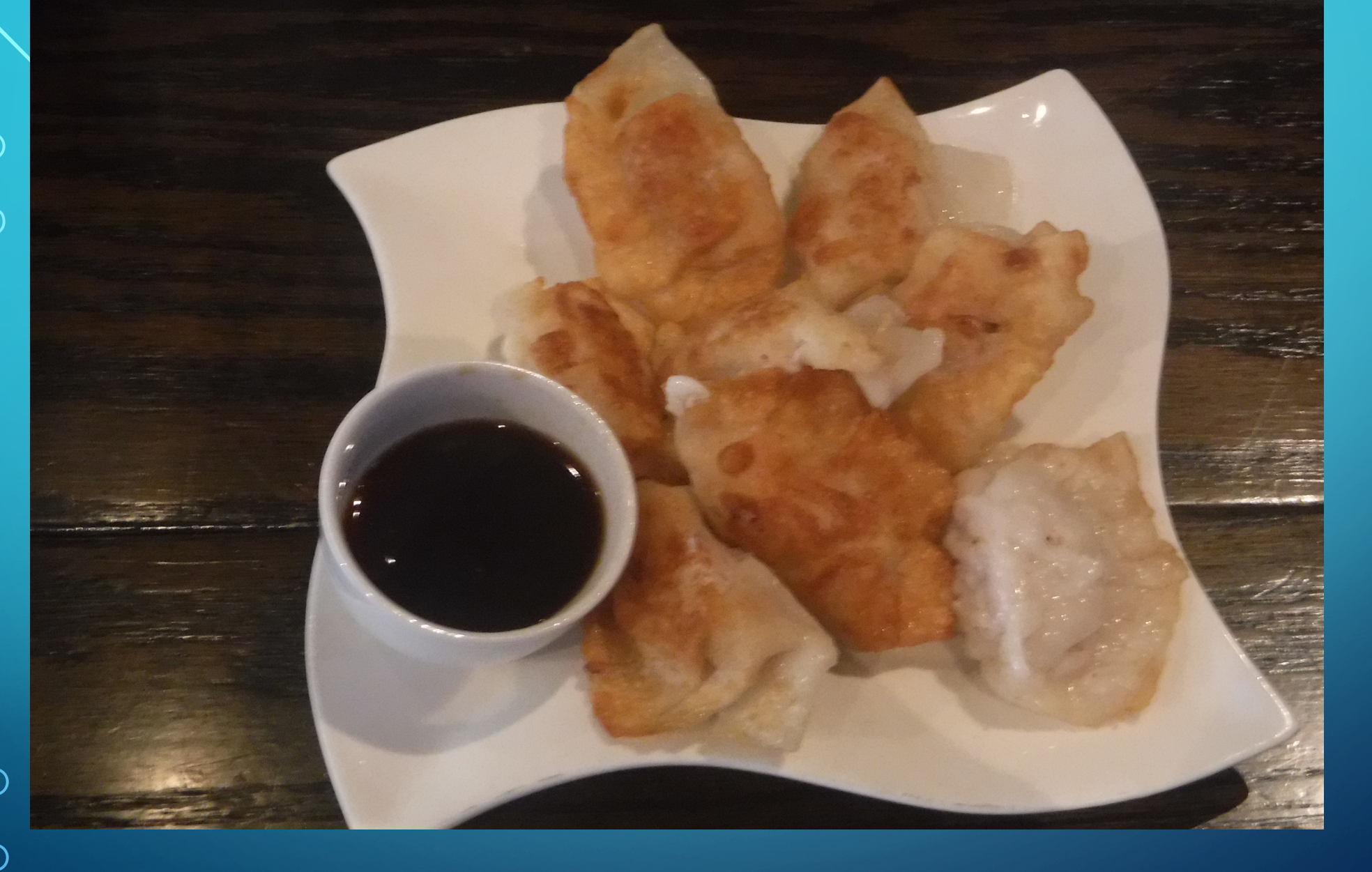
Backed clumps of dough with a surprise filling inside...