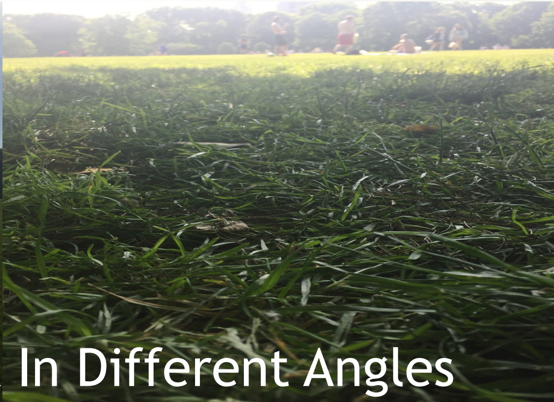
Central Park In Different Angles