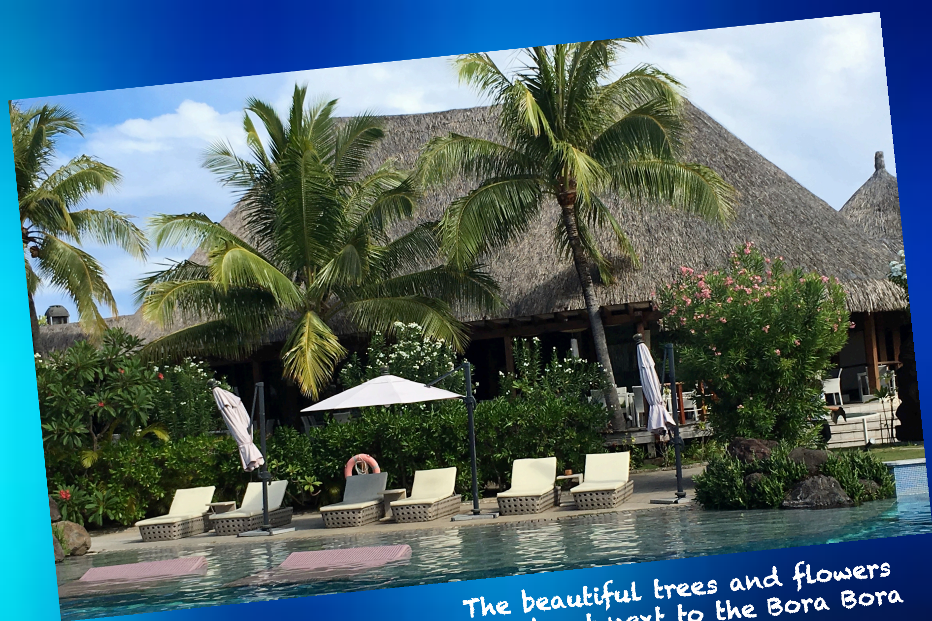
The beautiful trees and flowers stand out next to the Bora Bora Saint Regis hotel pool.