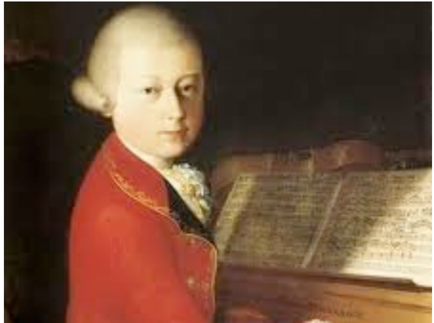
Mozart started playing the piano at the age of three

Until the age of three, Mozart was an ordinary baby. His nickname was Wolfy. He played with rattles and toddlers toys. When he turned three, he showed signs of superior musical talent. He began to compose music incessantly. One of Mozart's favorite things to do was to compose romantic music. One of the most famous compositions he wrote is Eine Kleine