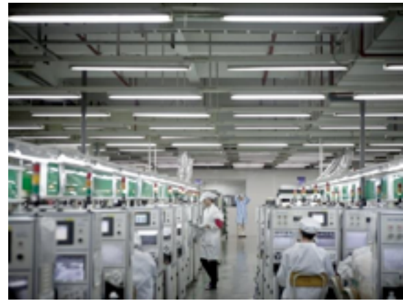
(Above) Apple factory

Do you have a special interest, if you're a kid? Then don't just sit there, and watch TV! Go try something out! If you work hard, you might even accomplish as much as Steve Jobs did!