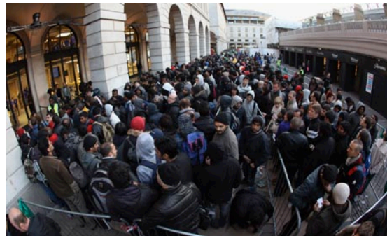
(Above) All the people waiting outside an Apple store