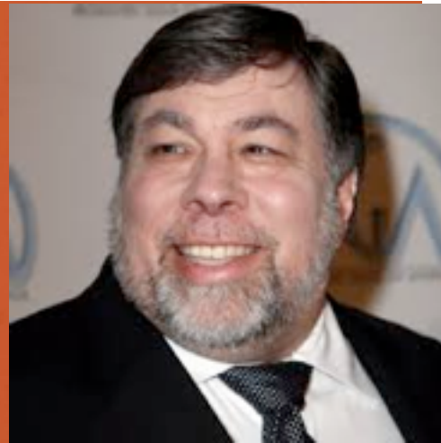
(right) Steve Wozniak