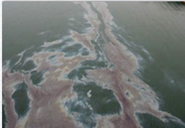
THE OIL SPILL IN THE GULF OF MEXICO CONTAMINATED THE WATER

Humans were also affected, because fisherman lost their jobs, and 11 people died from the collapse on the oil platform. Many more of them were injured.