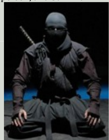
This is a pose ninja sat in before their masters

this are almost impossible because Osama was well, very powerful. I wish I could tell you more, but of course, ninja can hide things they did and their true identities. That is a reason why ninjas are so cool.