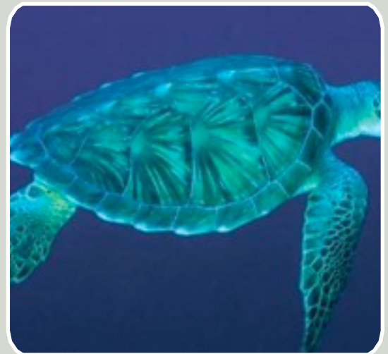
Ancient sea turtle.

feet long! You thought that was a lot well it weights 70 TONS! You will not believe how big its teeth are: they're 7 to 8 inches long!