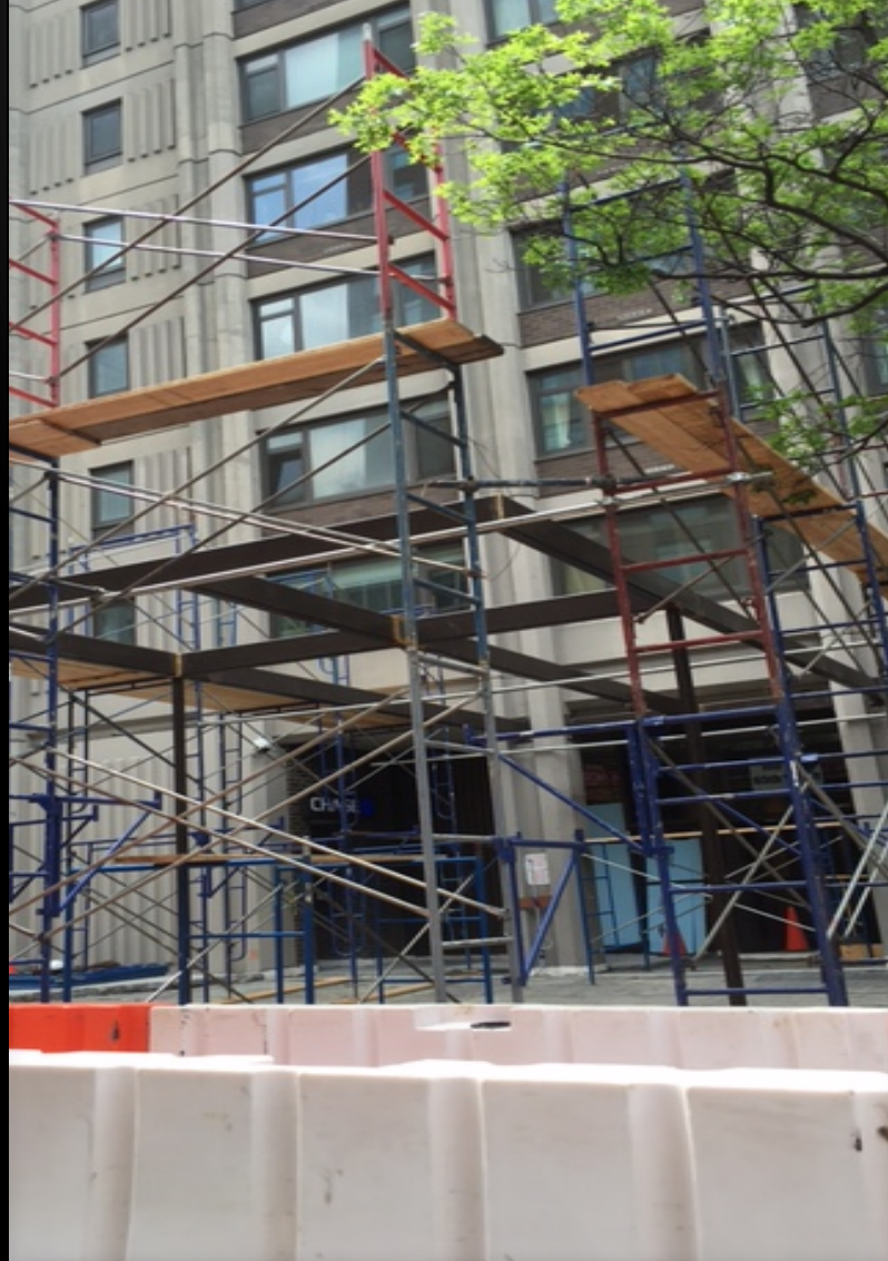
65 th and 3 rd