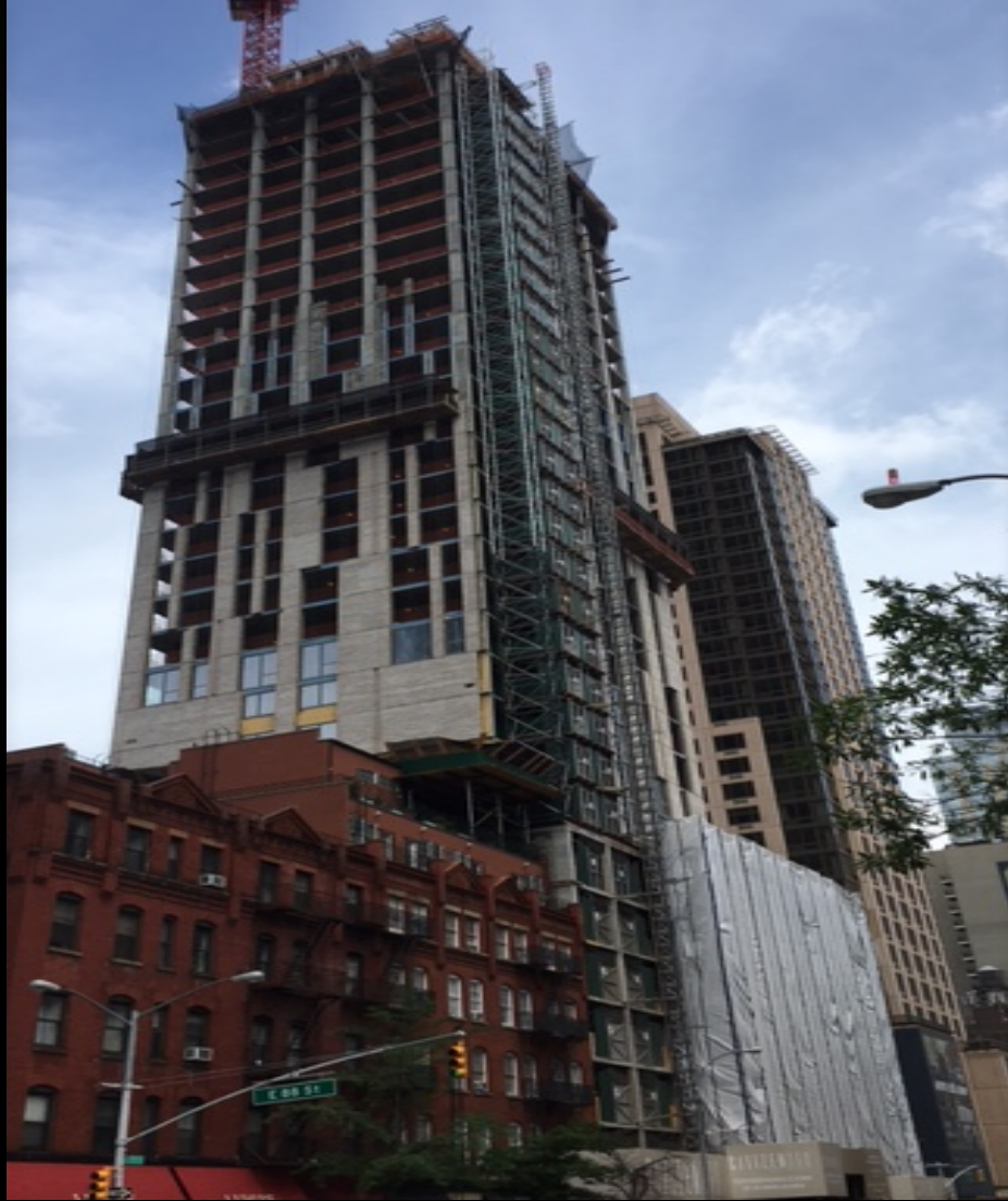
89 th and 1 st