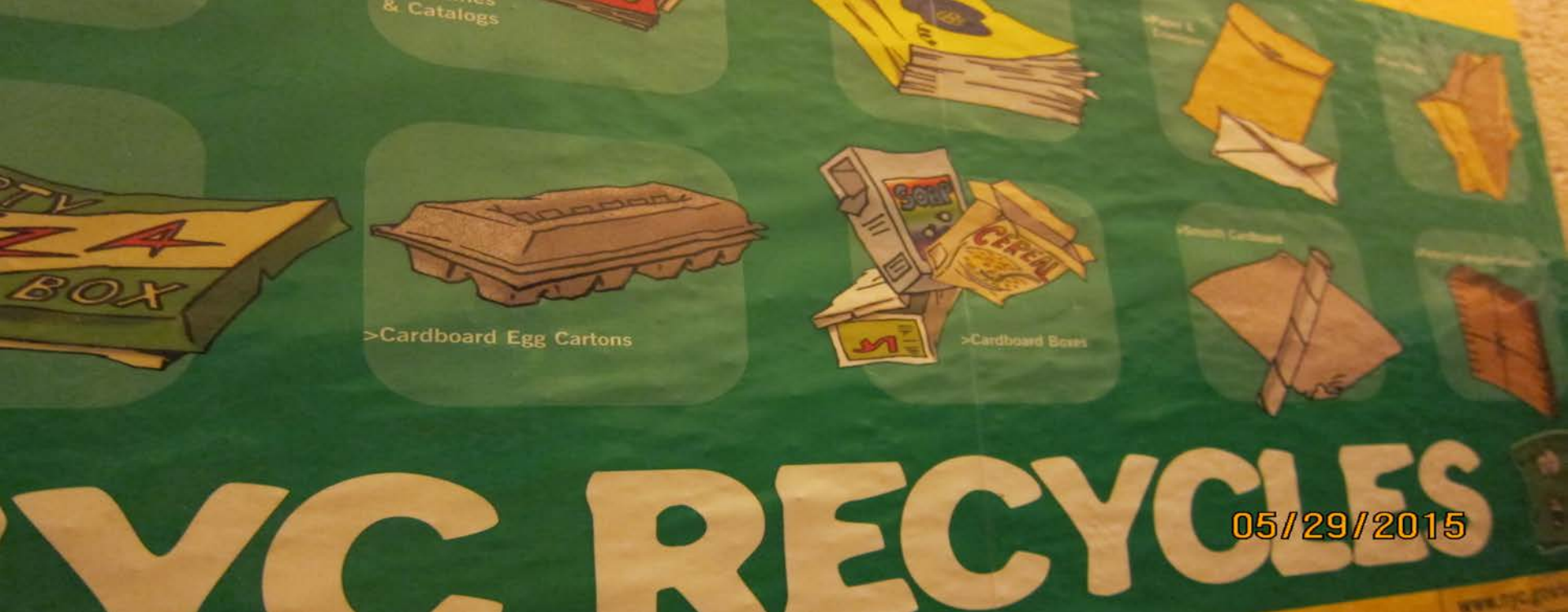
>Cardboard Egg Cartons