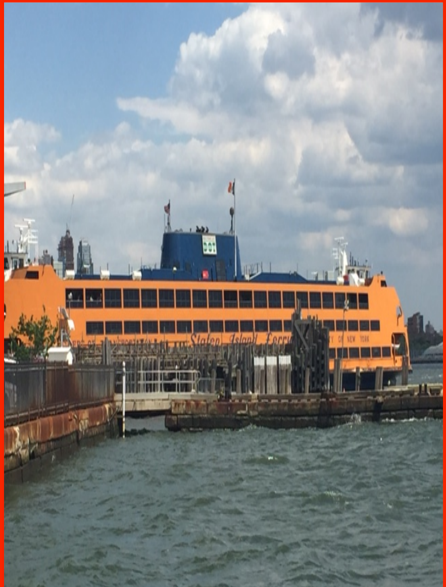
Staten Island Ferry

An experience I had was when my family were going to watch a minor league baseball game (Staten Island Yankees). We were on the ferry watching us move along the calm area of water. I saw very interesting sights like different boats, and the Statue of Liberty.