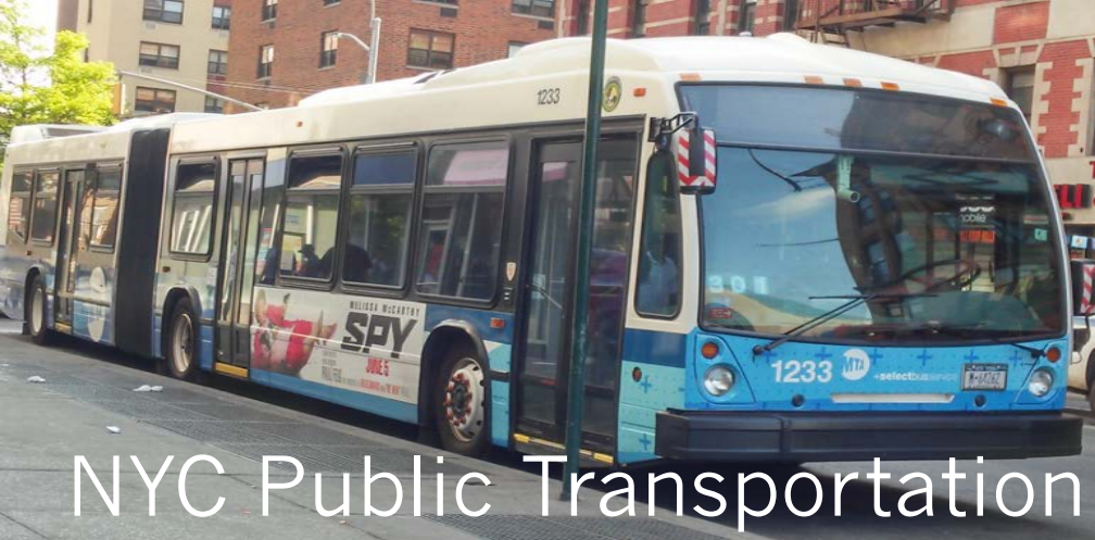
NYC Public Transportation