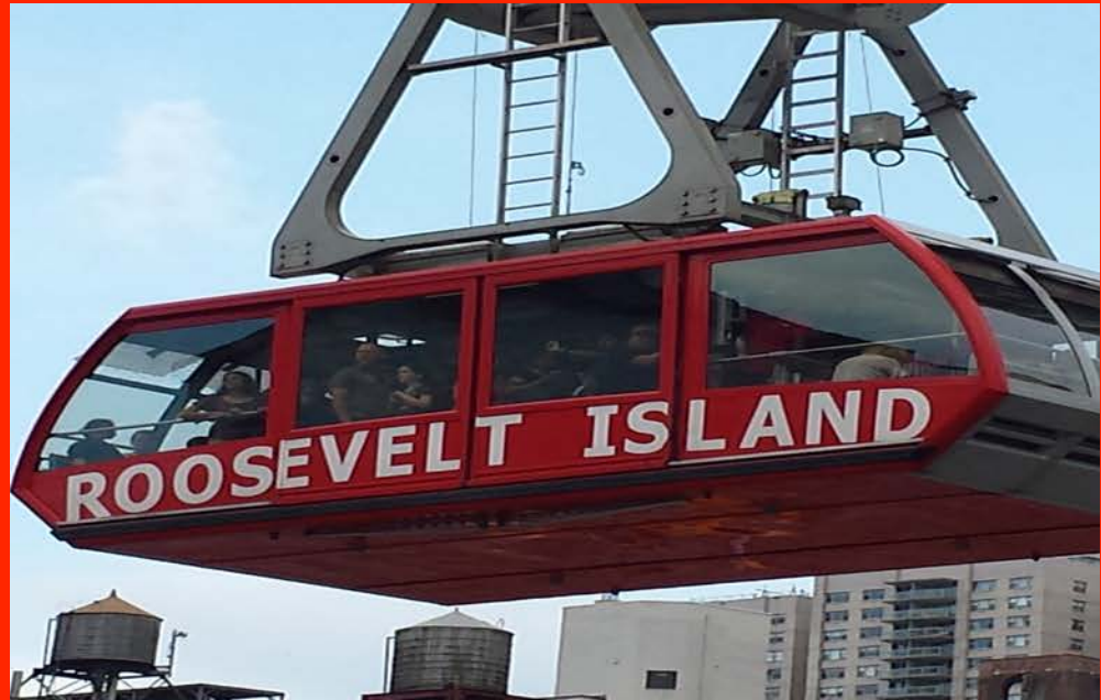
The tram to Roosevelt Island