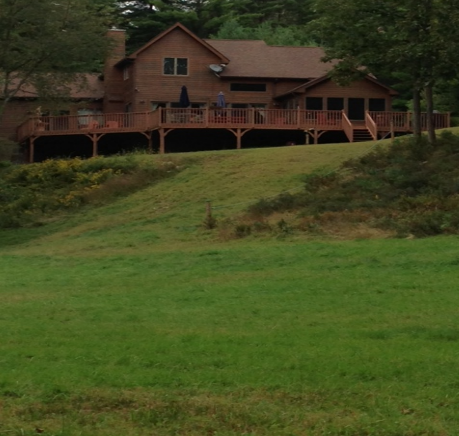
One of the houses