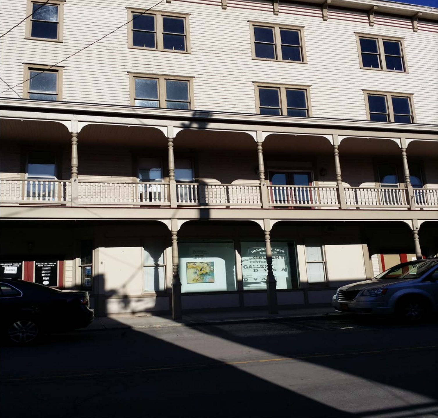
The Arts Building