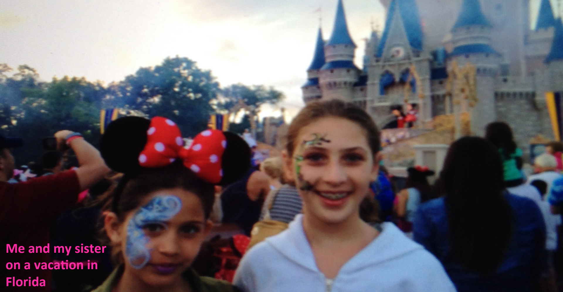
Me and my sister on a vacation in Florida

Vacations can also bring siblings together. I agree but me and my sister sometimes don't get along and sometimes we do get along. For instance, on a vacation we fought over getting an iPad and my sister got really upset but I said to her maybe we can share the iPad together and thanks to me I made the situation much easier for me and my parents